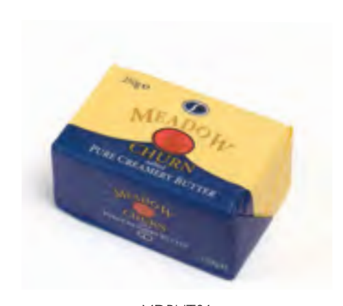
\begin{array}{c} \text{MDBUT01} \\ \text{Salted Meadow Churn Butter} \\ 40 \times 250 g \end{array}