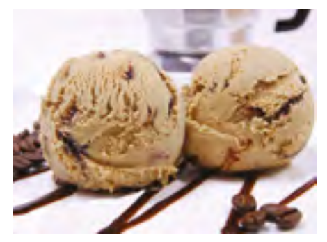
Coffee Mocha Swirl Ice Cream 4 Litre / Tub