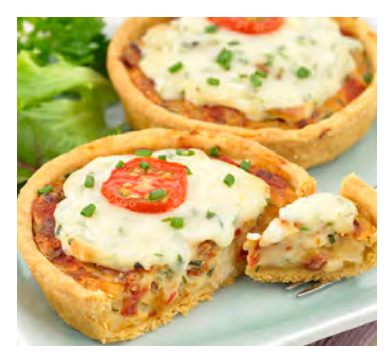
Tomato, Goats Cheese and Basil Tartlets (frozen) $12\times160g\:/\:Box$