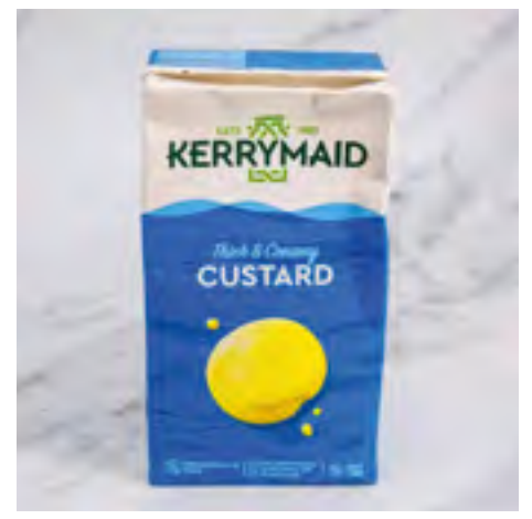
MDCRE03 Kerrymaid UHT Custard /*Each*