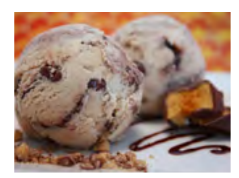
Honeycomb Swirl Ice Cream 4 Litre / Tub