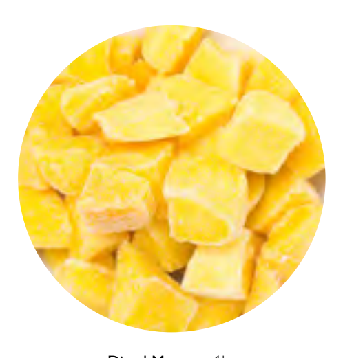
Diced Mango - 1 kg