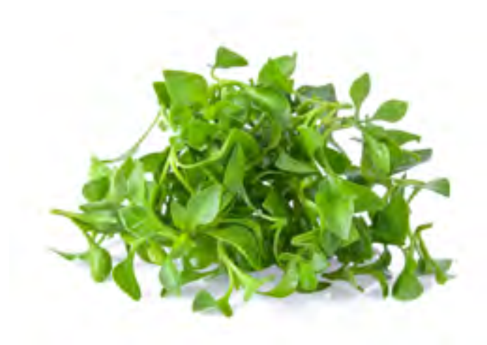
Hampshire Watercress – 16 bunches / Case