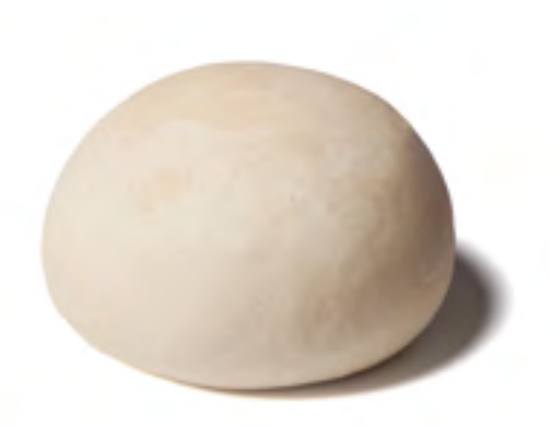
Sourdough Pizza Doughball (Frozen) -70 \times 220g / Case

Speciality Breads are a Red Tractor Certified artisan bakery, that uses 100% British wheat. They are also a nut and seed allergen free bakery.