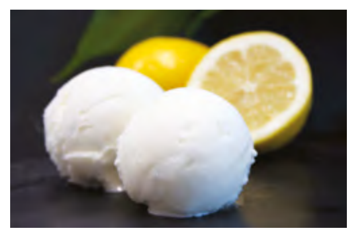
Lemon Sorbet - 2 Litre / Tub