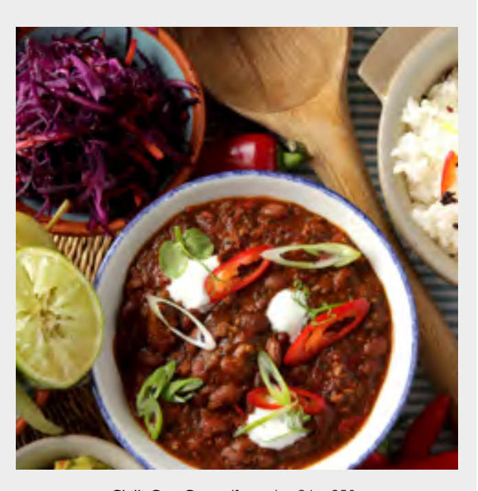
Chilli Con Carne (frozen) -36 \times 250g