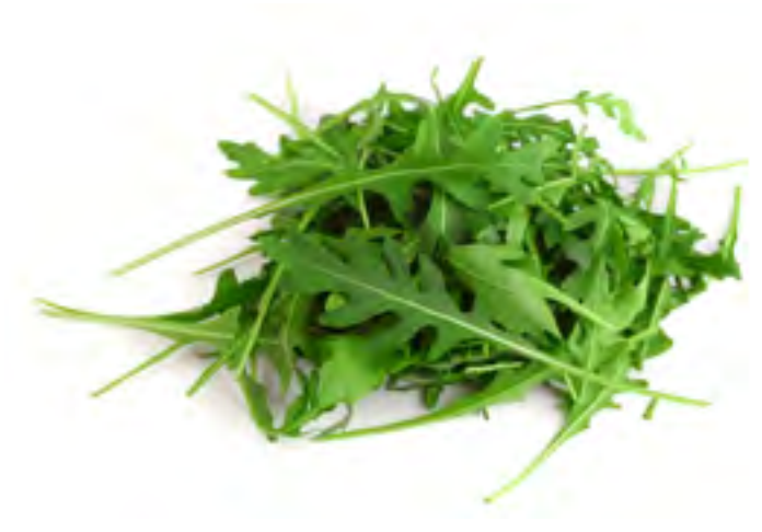
Rocket Leaves - 500g / Bag