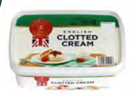
MDCRE01 Clotted Cream 1kg Tub /*Each*