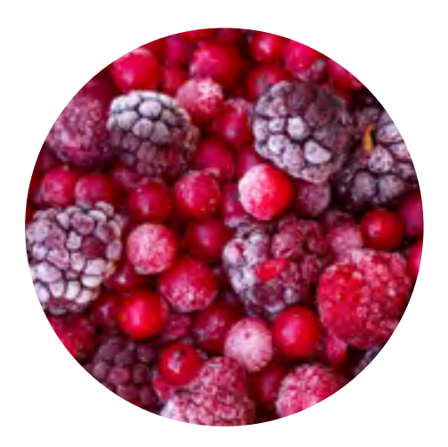
Summer Berry Fruit Mix - 1kg

Back in by popular demand these fruits are great for any caterer and suitable for any menu