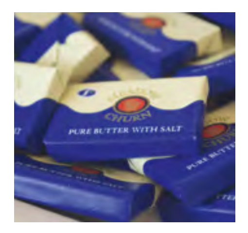
\begin{array}{c} \text{MDBUT03} \\ \text{Meadow Churn Butter Portions} \\ 500 \times 7g \end{array}