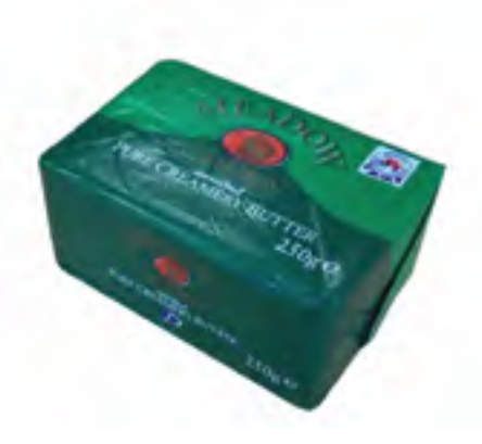
\begin{array}{c} \text{MDBUT02} \\ \textbf{Unsalted Meadow Churn Butter} \\ 40 \times 250 g \end{array}