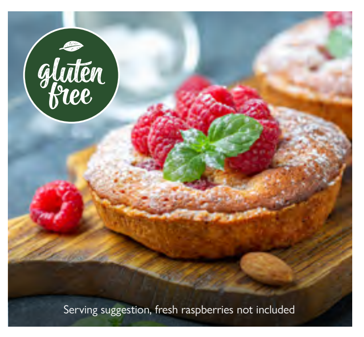
Raspberry and Almond Tartlet Gluten Free (frozen) 12\times 90g\ /\ Box