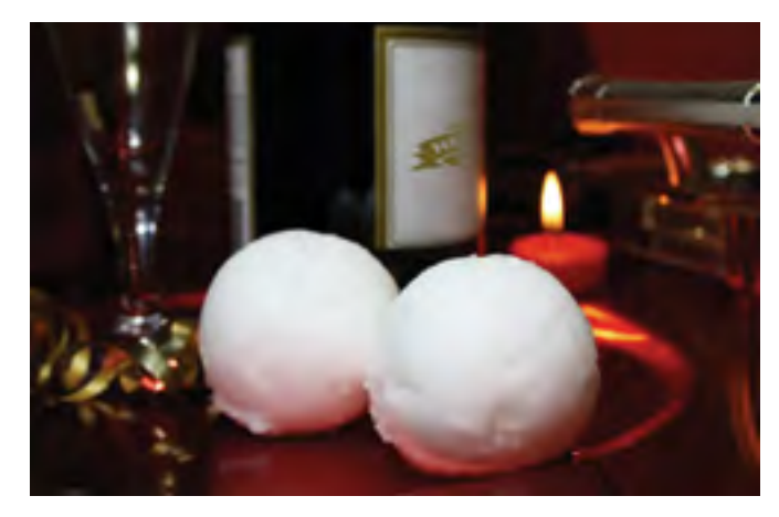
\textbf{Champagne Sorbet} - 2 \; \text{Litre} \; / \; \text{Tub}