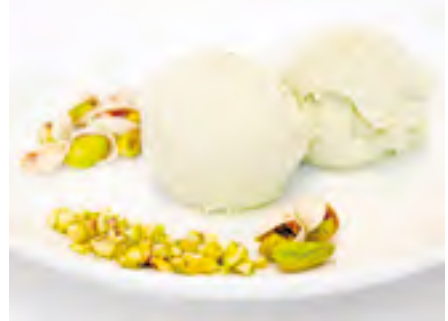
Italian Pistachio Ice Cream 4.75 Litre / Tub