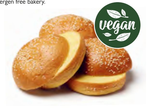
Plant based Glazed. sliced & seeded Brioche Buns (Frozen) 48 \times 90g / Case

These Brioche Buns are suitable for all burgers including Vegan and are topped with linseeds which are an allergen free seed.