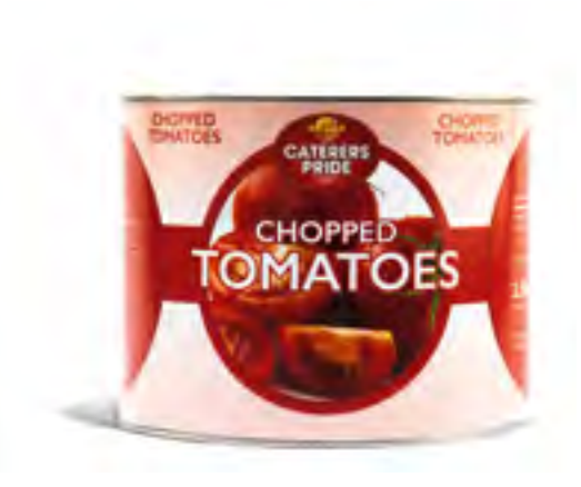
\begin{array}{c} \text{WWTOM03} \\ \text{Chopped Tomatoes} \\ 1 \times 2.5 \text{k / Tin} \end{array}