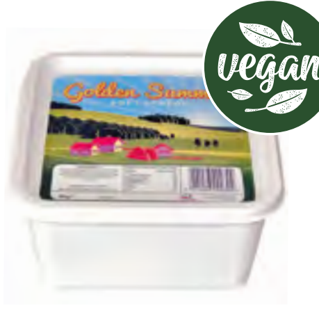
MDBUT04 Golden Spread (Cooking & Baking) *Vegan* 2kg /Tub