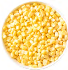
FROLEG03 Sweetcorn (1kg) /Bag *(Frozen)*