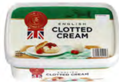
MDCRE01 Clotted Cream (1kg Tub) /*Each*