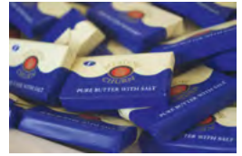
MDBUT03 Meadow Churn Butter Portions 5 x 100 x Size 7