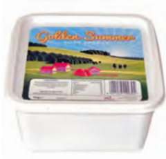
MDBUT04 Golden Spread (Cooking & Baking) *Vegan* (2kg) /Tub