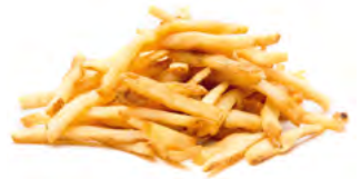
FRPCHP01 Supercrunch Skinny Fries Skin On 6 x 2.5kg/Case *(Frozen)*9.5mm