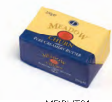
MDBUT01 Meadow Churn Butter Salted 40 x 250g