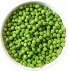
FROLEG03 Peas (1kg) /Bag *(Frozen)*