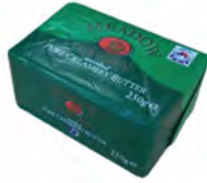
MDBUT02 Meadow Churn Butter Unsalted 40 x 250g